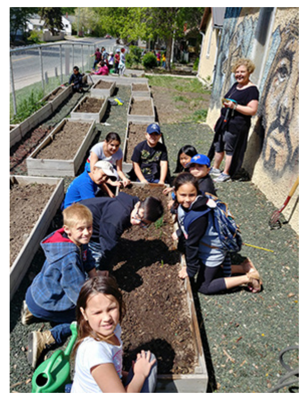
Students from Sacred Heart School plant one of the North Central Community Gardens