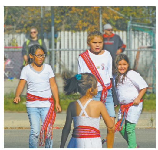
Seven Stones Steppers perform at North Central Street Fair for Culture Days.