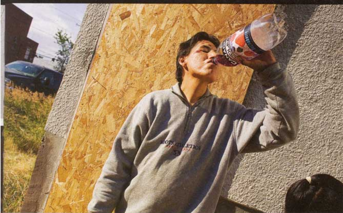
A TWO-YEAR-OLD (top) plays in the yard of her family's North Central home; a celebratory gulp honouring the birth of a friend's first child; worshippers pray for change at Four Winds Gospel Fellowship (left)

23 per cent of those accused of that crime. At least 11 of Regina's 16 murder victims since the beginning of 2005 were native. The identity of the killers isn't as clear, since eight of the 16 murders remain unsolved (as of late last year, the Crown was reviewing evidence with an eye to laying charges in one of those cases).