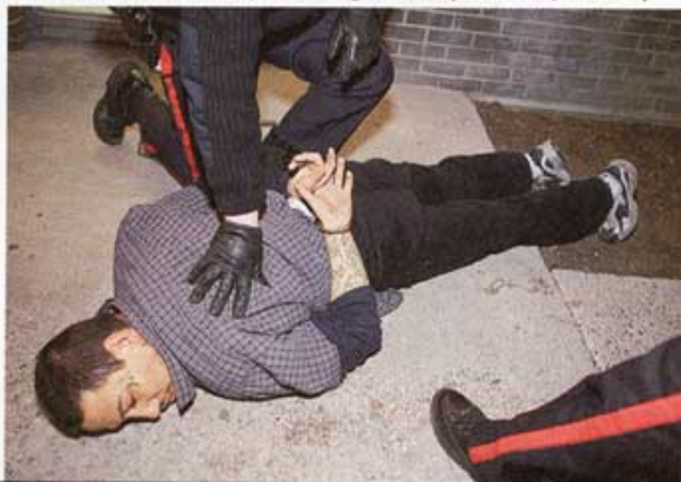
A FIRE INSPECTOR (left) checks out an abandoned home in the North Central area; police deal with one of the highest crime rates in Canada; and drug use is epidemic (bottom)

'IN A THIRD WORLD COUNTRY HERE,' SAYS A COMMUNITY ASSOCIATION PRESIDENT