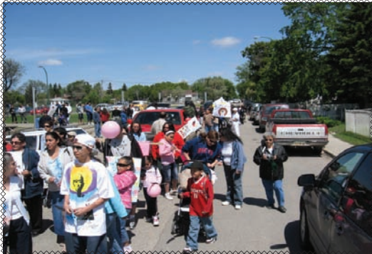
March Against Violence, May 25th, 2007

One of the questions we asked at the first "Community Leaders Forum on Gang Violence" on December 2, 2007, about what strategies were needed to prevent recruitment of young people into gangs,