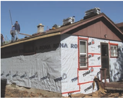
Another family in North Central fixing their house thanks to the homeowner repair program