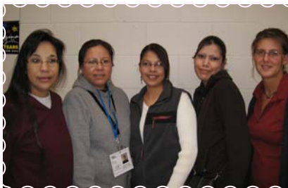
Rental Survey Interviewers

Thank you to everyone who has taken the time to complete the survey, we appreciate your input!