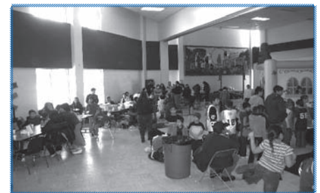
Multipurpose room Albert Scott Community Centre

We expect to see you next year and have another great event and more surprises!