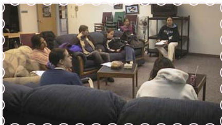
Renters information session at Four Directions

The project began January 11, 2007. The interviewers have been conducting door-to-door surveys, arranging coffee parties, attending meetings with groups, and setting up at drop in centres.