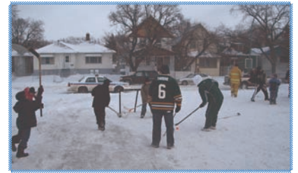
Hockey tournament at the Scott Collegiate Field

Not even the cold weather could stop our community from having fun at our 3rd Annual Community Christmas Fun Day. Some of the activities throughout the day included Horse & wagon rides, shinny, crafts, bingo, face painting, coffee & tea room; and for the first time we included Pictures with Santa for everyone.