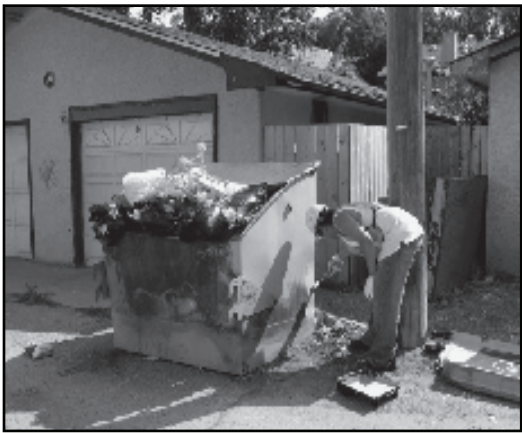
Graffiti removal from garbage bins

The participants in these programs focused on getting rid of the graffiti in the area around Mosaic Stadium. We will continue that work until the end of September, as our budget allows.