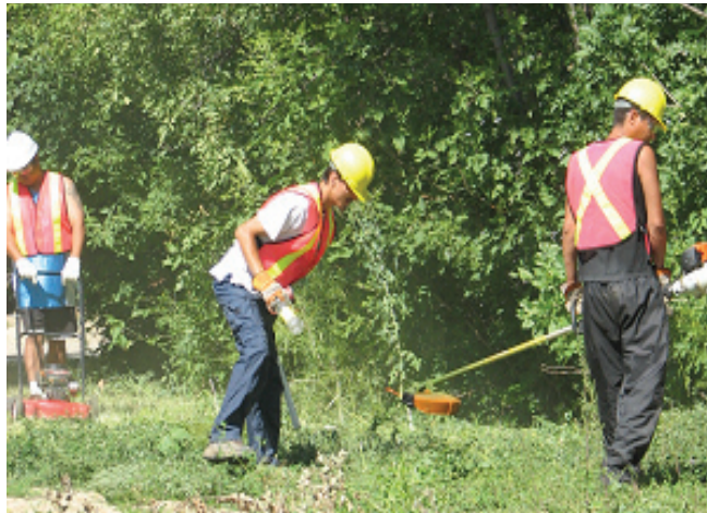
Participant from the YEP

Their positive attitudes, dedication, and commitment have made the program a great place to be.