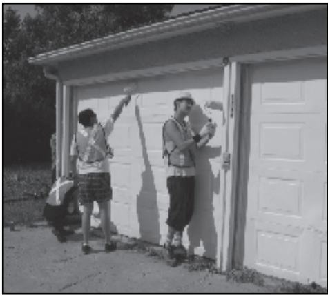
Graffiti was removed from garage doors and people's houses

We are looking for people/organizations/businesses willing to have a mural painted on their property. (See our ad on page 5) We are organizing them so that an artist will be working with youth from North Central to assist in creating a vision and a plan, as well as teaching techniques and overseeing the project. It's all very exciting and just keeps growing!!