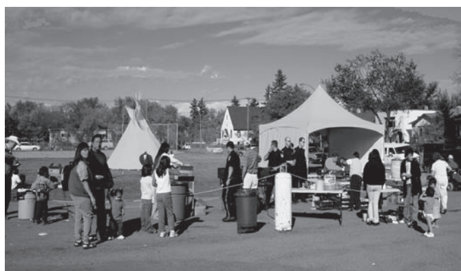
Last year's celebration 30th Anniversary, now the Fall Fest