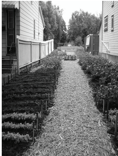
Community Gardens at 13 block Rae Street

Barbequed hot-dogs, with veggies and watermelon were served up by even more volunteers - the ones with clean hands! Things were really starting to shape up and the plot was indeed thickening! "Who has a large piece of paper so we can map out what's going to be planted where?" Never mind, that's what sidewalk chalk and the