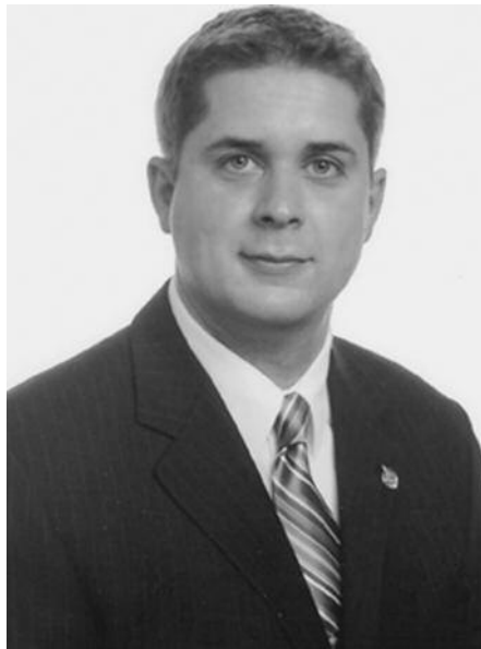
Andrew Scheer, M.P. Regina-Qu'Appelle

We will also institute the Patients Wait Time Guarantee which will ensure all Canadians get the timely access to quality health care that they deserve. As it currently stands thousands of people are waiting for critical care, hip and joint replace-