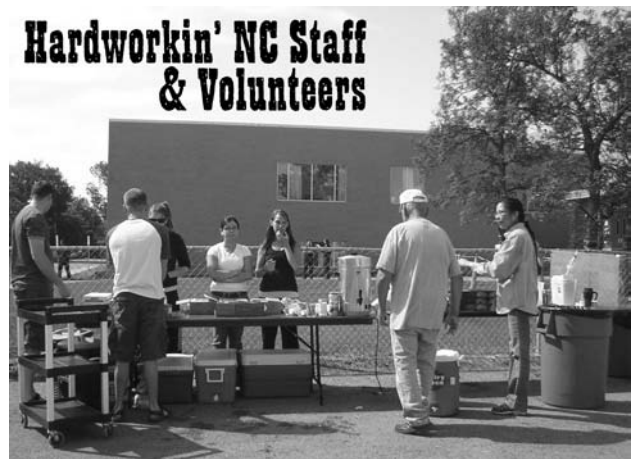
NCCA Staff & volunteers from Red Lobster serve up coffee & hotdogs at spring cleanup